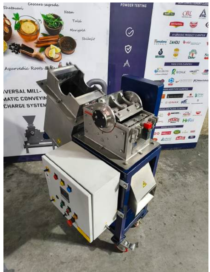
▶ Internal view of the KNIVA Knife Granulator