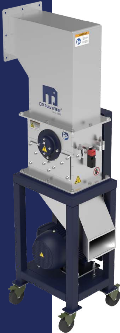
DP® KNIVA Knife Granulator Knife Cutting Mill