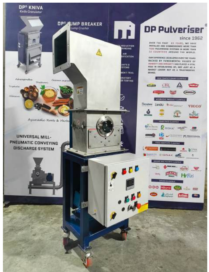
► IDP® KNV-20/20 Knife Granulator ready for dispatch