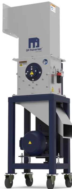
▶ Standalone KNIVA Knife Granulator