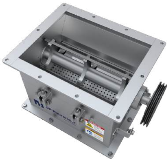
▶ Internal view of the KNIVA Knife Granulator