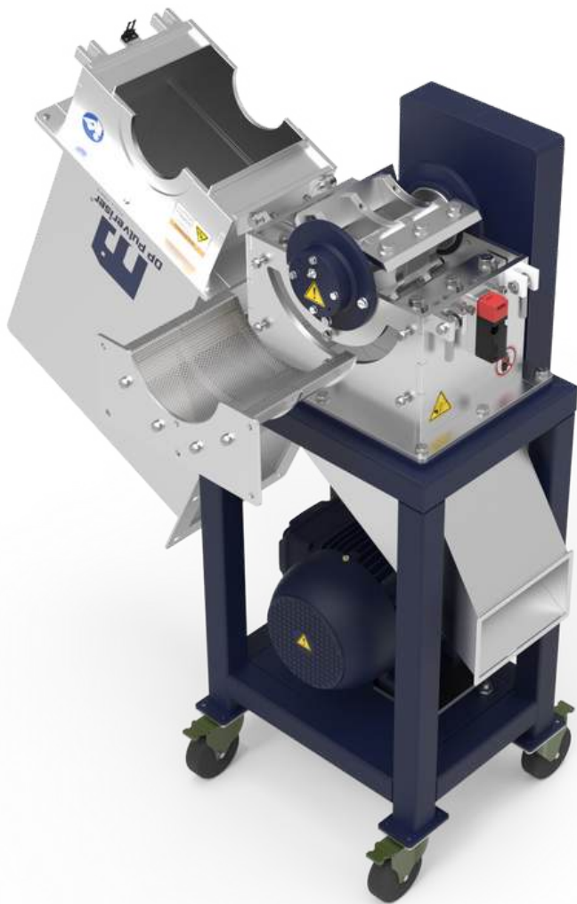
► Internal view of Knife Granulator